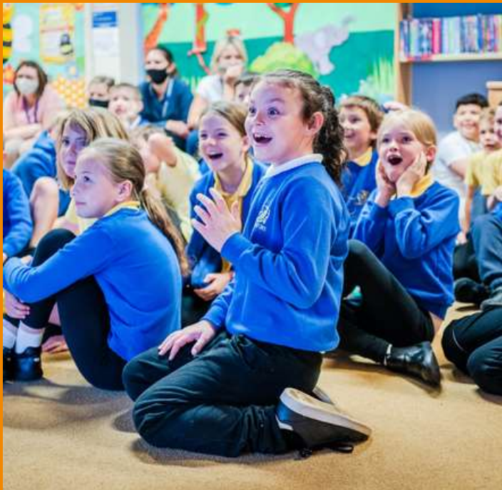
Literacy and Learning