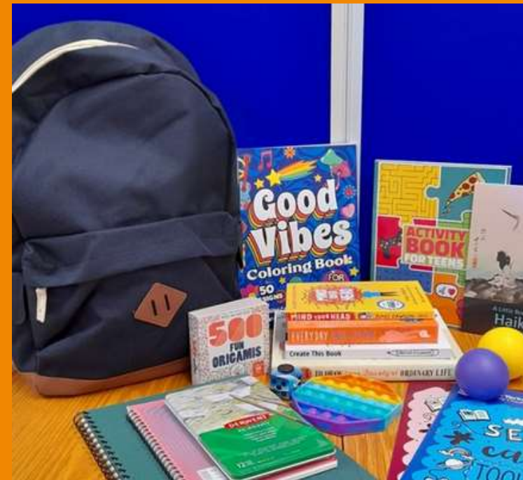
Health and Wellbeing